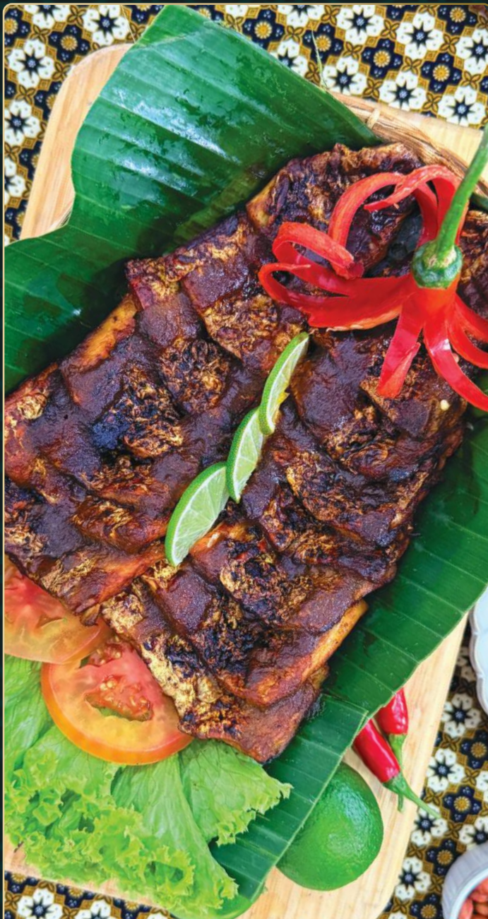
BALINESE GRILLED BARAMUNDI FISH