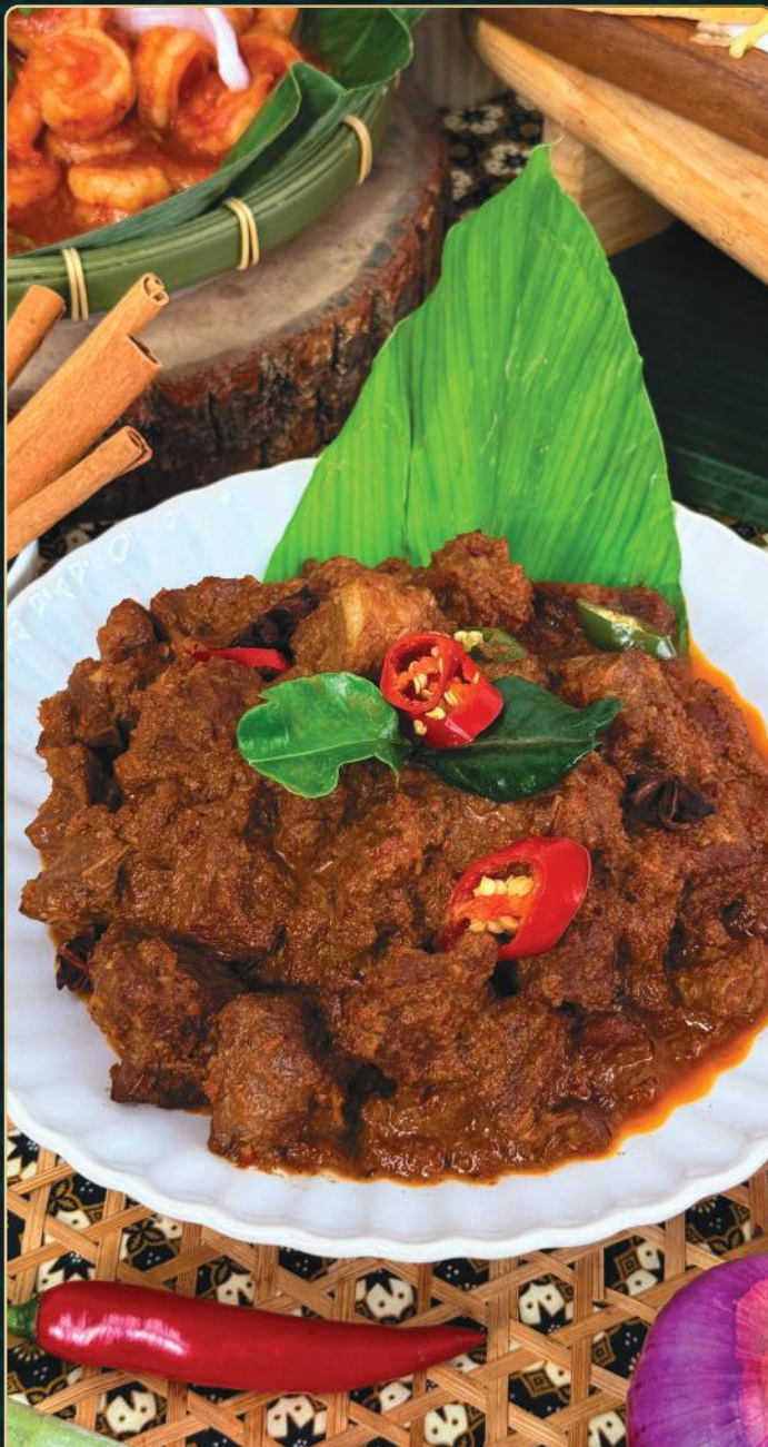
NYONYA BEEF RENDANG