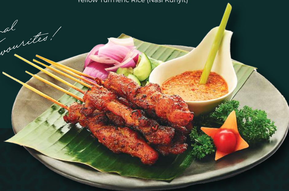
CHARRED GRILLED CHICKEN SATAY WITH PEANUT SAUCE