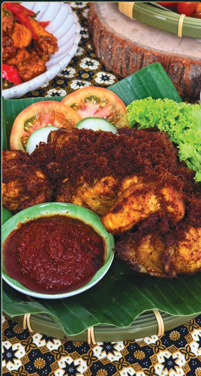
AYAM GORENG LENGKUAS